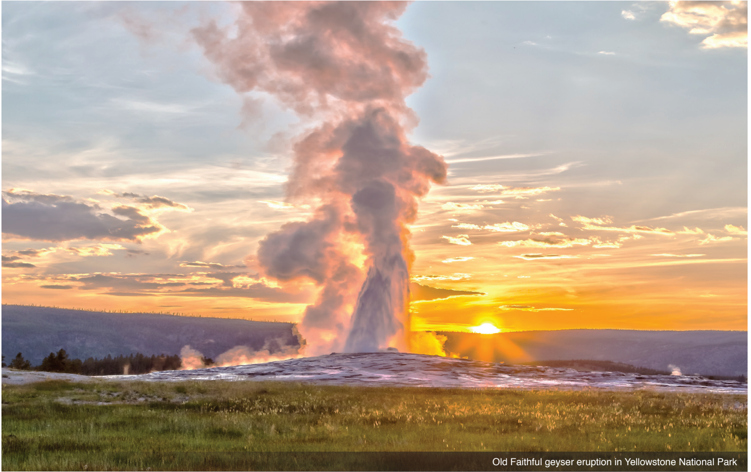
Old Faithful geyser eruption in Yellowstone National Park