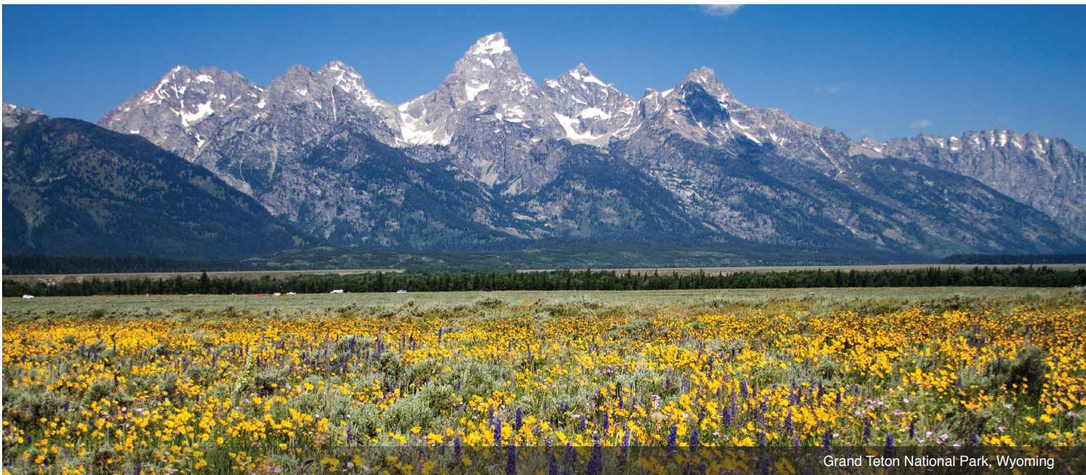
Grand Teton National Park, Wyoming

geysers, and hot springs. Then, head for storied Old Faithful geyser, named for its regular eruptions about every 80 to 90 minutes for some 150 years, before returning to your park lodge. Meal: B