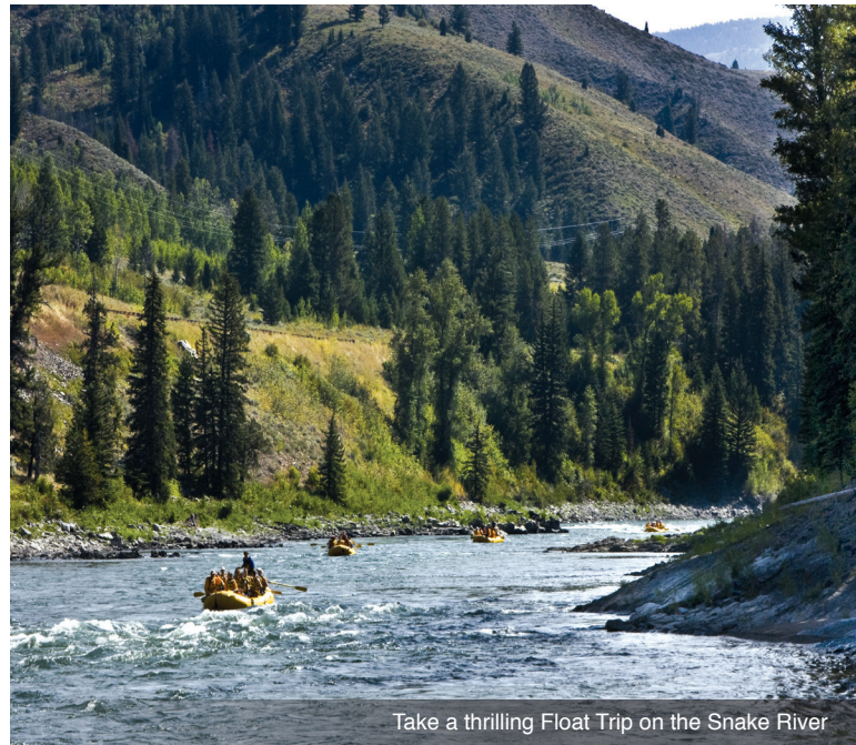
Take a thrilling Float Trip on the Snake River